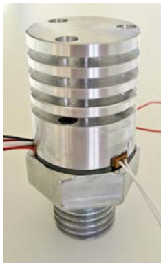
TE-Power-Bolt Thermogenerator with adjustable voltage

Micropelt GmbH, manufacturer of thin-film thermoelectric chip-like devices, announces the TE-Power-Bolt, a voltage adjustable thermal battery that uses excess heat to generate electrical energy for devices that consume only a few milliwatts (mW) of power, such as wireless sensor nodes. With its micro-thermogenerator that is built into an M24 steel screw, the Power-Bolt can harvest energy from surfaces and structures from 10 - 20 degrees Celsius over ambient temperature or directly from hot liquids. Output power can range from 0.2 to over 15 mW and is voltage stabilized by an integrated DC-DC converter, which can be set to fixed voltages between 1.2 and 5 Volts.